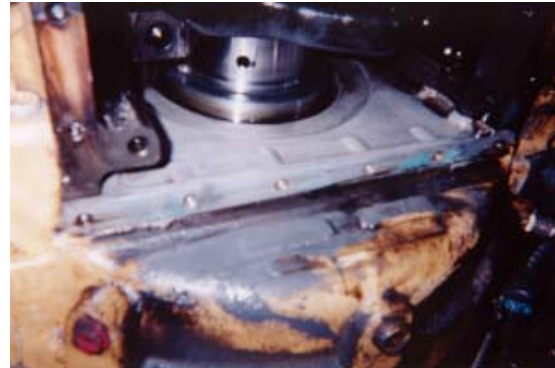
rear crankshaft seal