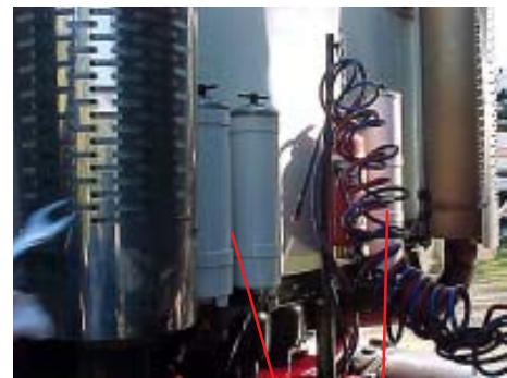
FMO2 oil, FMF3 fuel filters