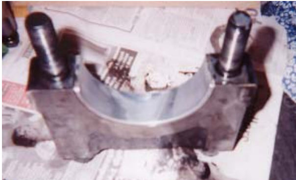
main bearing cap